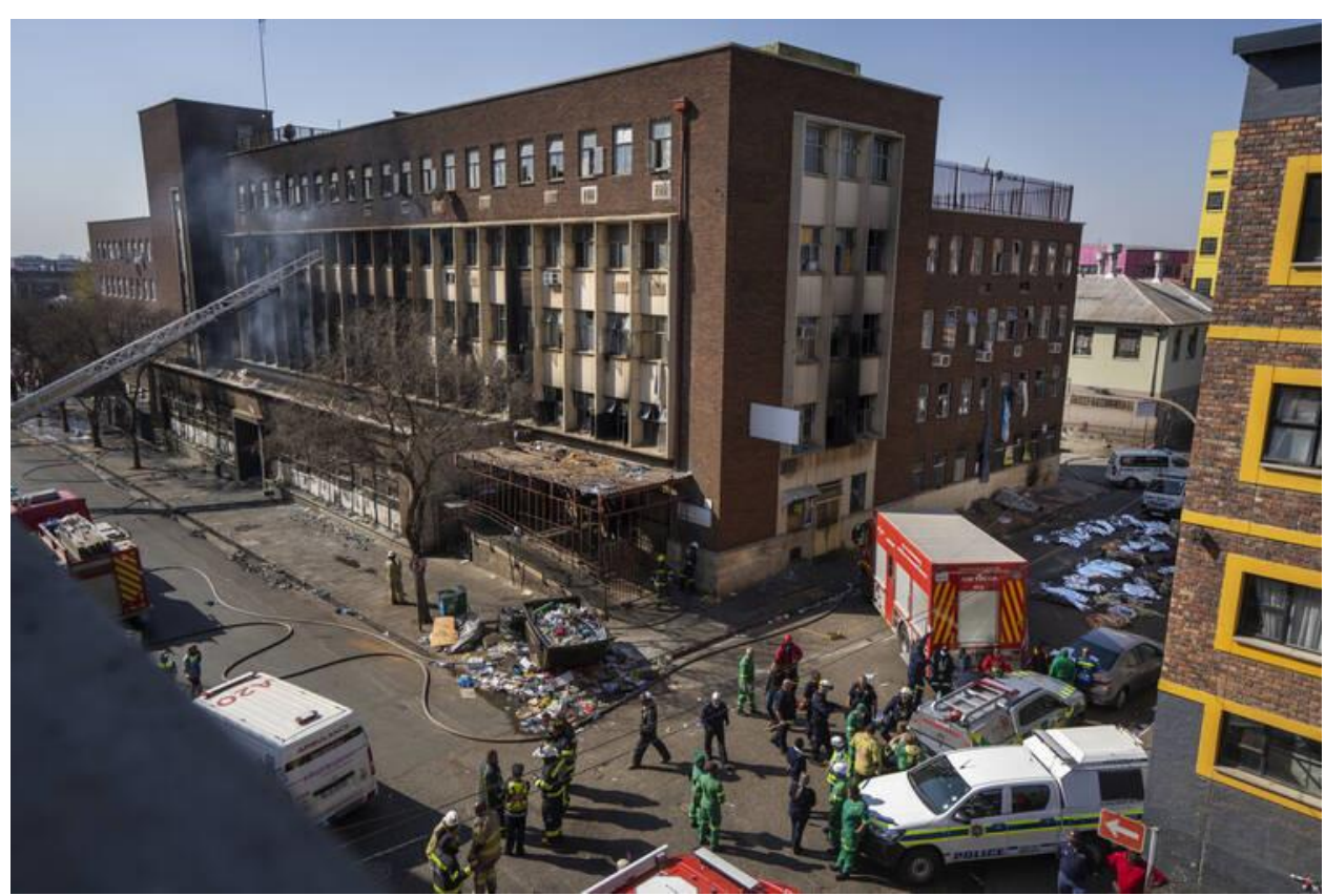
Figure 1: Medics stand by the covered bodies of victims of the deadly blaze in downtown Johannesburg.

In the Usindiso fire aftermath, City authorities tried to shift the blame to NGOs and migrants. This gaslighting of civic housing-rights organizations and the general public speaks to the municipality's unwillingness to take responsibility for the housing crisis within its inner city jurisdiction. Despite these tactics of dissimulation and the City's ongoing recalcitrance, we call upon your solidarity in defending the rights of vulnerable people who face various hazards in the City of Johannesburg, including forced evictions and other violence at the hands of either state organs, private owners or criminal gangs with no alternative accommodation and in direct contravention of the rights enshrined in the South African Constitution.